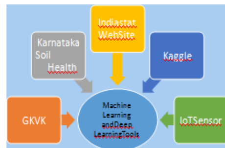
Figure3: Different Dataset Used

The primary goal of this work is to construct an IoT-based Automated Soil Quality Evaluation using Enhanced Deep Learning Model to aid agriculture in employing IoT and machine learning techniques. This research aims to classify the region based on SQI using sample data collected in and around the districts of Erode and Coimbatore in Tamil Nadu, India. Figure 4 and 5 depicts the agriculture field in Coimbatore and Erode region respectively. The index report was designed for decision-making to offer fertilizer suggestions to specialists based on the categorization findings. Furthermore, the DL-based soil quality evaluation aids in reducing unnecessary fertilizer use and the measurement of soil and ecological sustainability