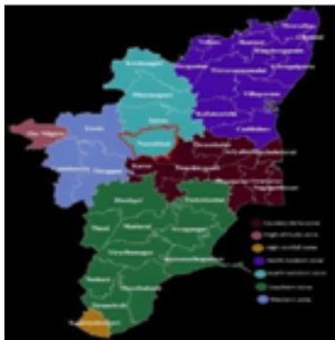
Figure 2: Soil Types in Various Agro climatic Zones