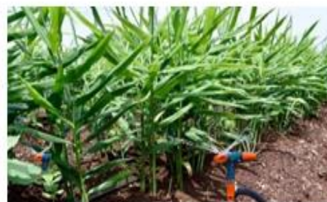
Figure5: Agriculture Field in Erode