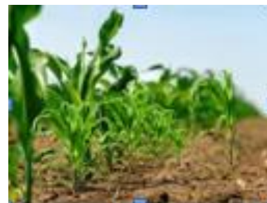
Figure4: Agriculture Field in Coimbatore